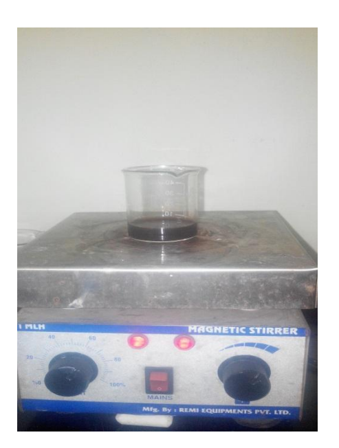
Figure 1: Image showing the Green synthesis of Silver nanoparticle.

UV-visible spectroscopy is a technique to find the properties and formation of different nanoparticles where, the nanoparticles synthesized are influenced by their shape, size, free electron density, interparticle interactions and medium surrounding it. In the present study, reduction of silver ions present in the aqueous solution of silver nitrate during the reaction with the ingredients of Saroca asoca leaf extract has been seen by the UV-Vis spectroscopy